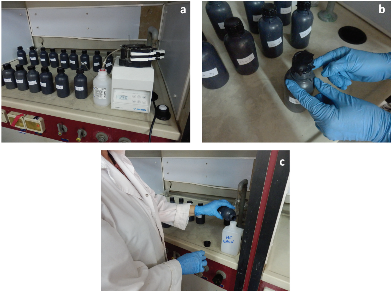
Figure 1. Setting of the HF etching procedure within a chemical fume hood. a) The HF is transferred from the HF bottle to the sample bottles through the peristaltic pump. The cup connected to the pump tube (sample closest to the pump) is moved from one sample to the next. b) The bottle cap that is moved from sample to sample has two holes, one with the exact diameter of the tube, where it is placed, and a smaller one to release air. c) After 40 minutes of soaking, the spent acid is carefully poured into a waste bottle. Note that the sample will settle in the shoulder of the bottle.